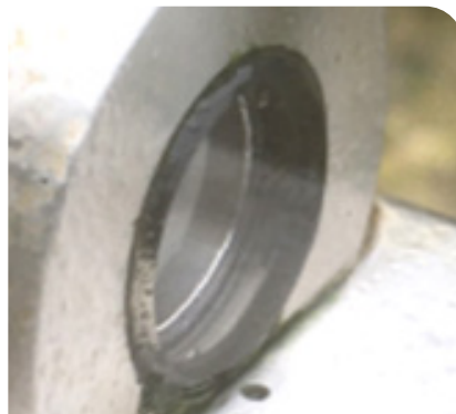
Optical cells with cleaning by compressed air