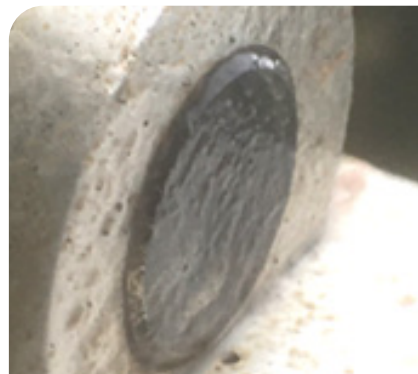
Optical cells without cleaning by compressed air