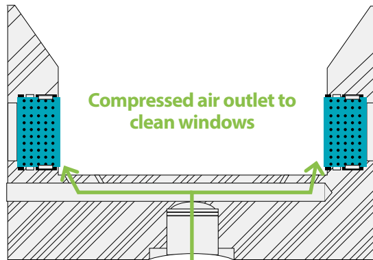
Fitting for 5 bars compressed air input