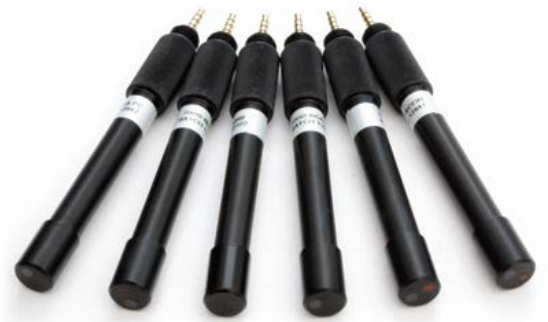
Choose from a range of optical sensors for use in the AP-LITE, see the full range in the specifications section

^{*} ^{*} 100m submersion for period of 1 week, 30m submersion suitable for permanent deployment.